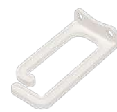
Cable management brackets