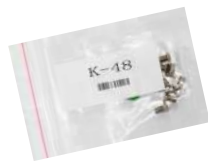
K-48 screw kit